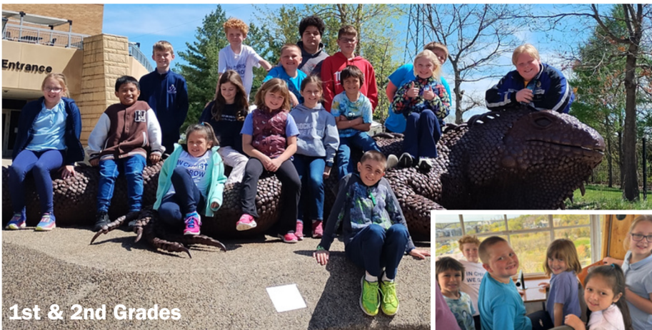
1st & 2nd Grades