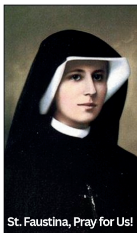
St. Faustina, Pray for Us!

Our Lady, Comforter of the Afflicted, pray for us.