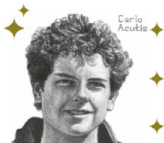
ART BY PACEM STUDIOS