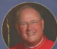
Keynote Speaker Cardinal Timothy Dolan