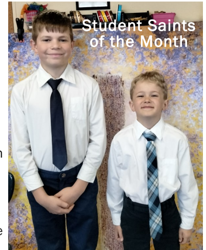
Student Saints of the Month

Each month OLP PreK-6th grade students focus on a special Service Project : October raked leaves in three yards; November brought items and packed boxes of Joy that were sent to children across the ocean who are less fortunate; December performed at Kingsway Home Christmas Program, "Walking Through the December Saints". January making tie blankets for patients. February creating Valentine cards for families at Mary's Place in Minneapolis, March students brought 267 pounds of food to local Food Shelf. Well done!