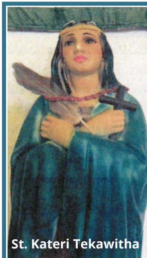
St. Kateri Tekawitha

Did you know your contributions can be automatically deducted from your checking, savings, or credit card account? For more information call the parish office at 952-873-6564 or check out our website.