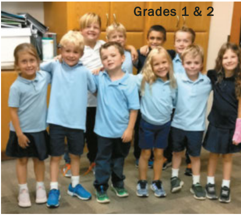
Grades 1 & 2

Hi Families, Welcome back to the 2023-24 school year! Can't believe we are already at the end of September. Our class has made wonderful adjustments from being at tables last year to sitting at a desk this year! Big transition for young children. Once a week we clean our desk and make sure everything is in the right order.