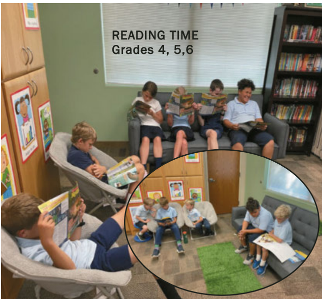
READING TIME Grades 4, 5,6