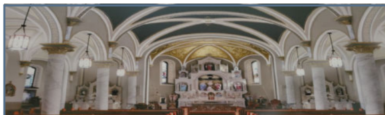
Church Painting collected as of 6/25/2023: $323,126.61