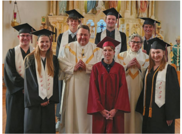
2023 Graduation Mass Tuesday, June 6

Member: $700/lot + $200 for perpetual care Non-member: $1,400/lot + $200 for perpetual care