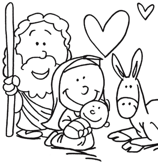
Mary Mother of God • Luke 2:16-21

Read the Gospel of the week and color the image.