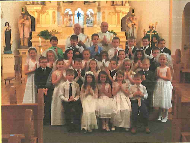
It was a blessed day on Sunday, May 6, 2018!